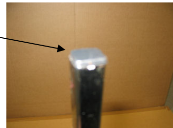
Black end cap