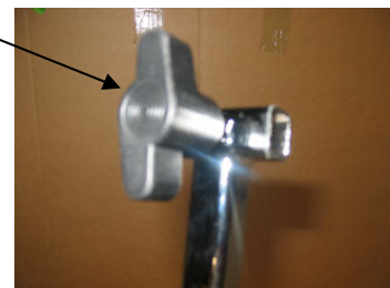
Adjustable knob on support rod